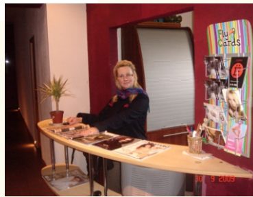
Our hostel. Reception.