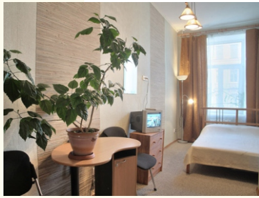
Our hostel. Double room

The school have the possibility to accommodate students in our shared flats as well as in the apartment for rent. All accommodations are located in the city-centre and not far from the school.