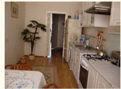
Our shared flat